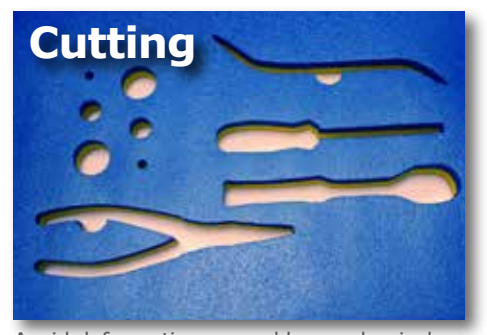
Avoid deformation caused by mechanical processes: the i401 provides a noncontact, fully digital solution that allows customized results on even the most challenging materials.