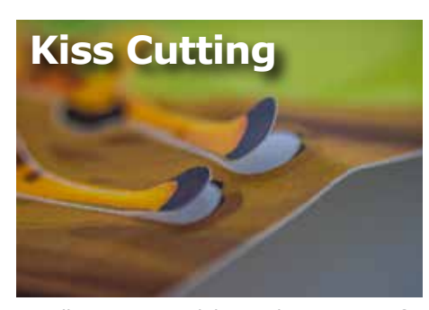
Excellent power stability and 400 Watts of average laser power delivers the precision and throughput speed required for high speed label kiss cutting.